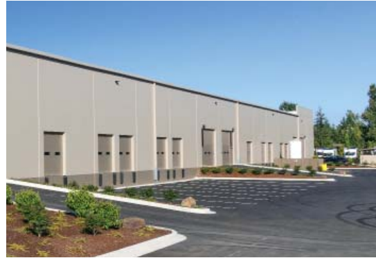
Airport Way Business Park 17820 NE Airport Way, Portland OR 97230