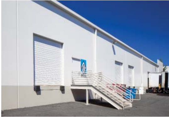
Boeckman Corporate Center Boeckman Rd & SW 95th Ave Wilsonville OR 97070