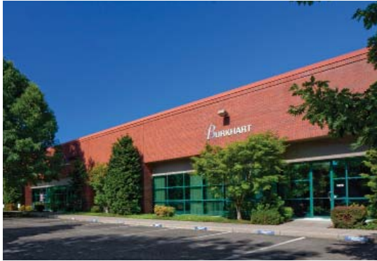
International Corporate Center 11719 NE Glenn Widing Dr Portland OR 97220