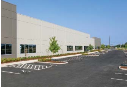
Mill Creek Corporate Center 3315 Aumsville Highway Salem OR 97317