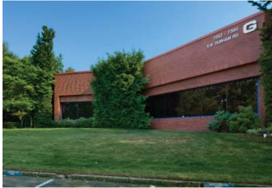
PacTrust Business Center 16505 SW 72nd Ave Portland OR 97224